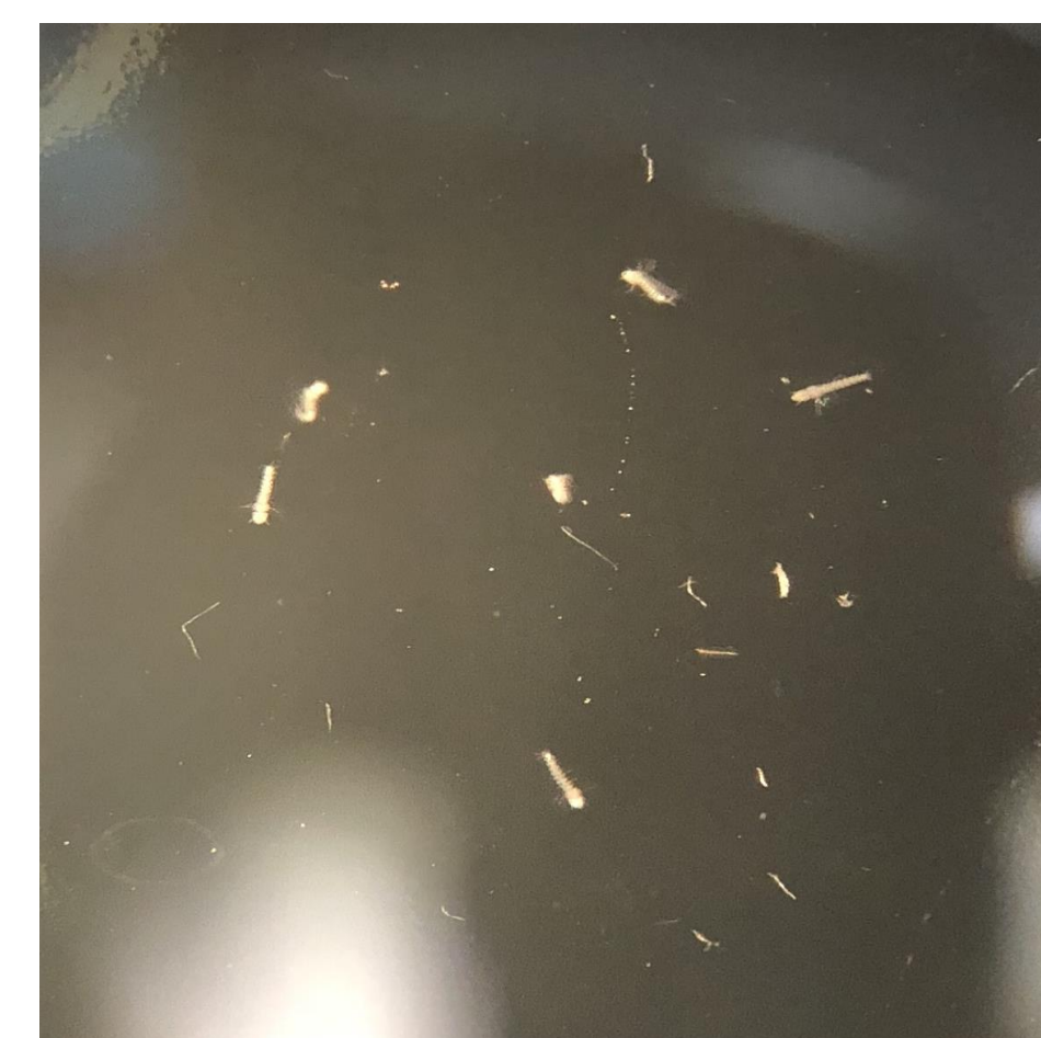
▲ Figure 1: Larvae seen under the microscope