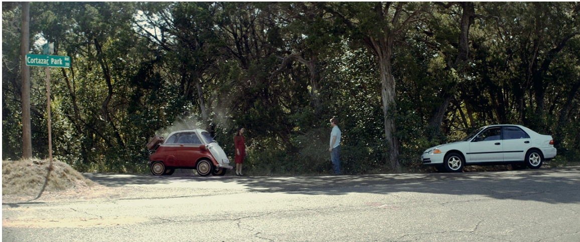
Fig. 8 Mariana's Isetta

royalty free stock digital models of various machines to populate the details of Leon's contraption, resulting in something far more intricate than I could have modeled on my own. This helped to sell the idea that Leon has been building the Paykel Device out of junk for the past ten years (Fig. 9).