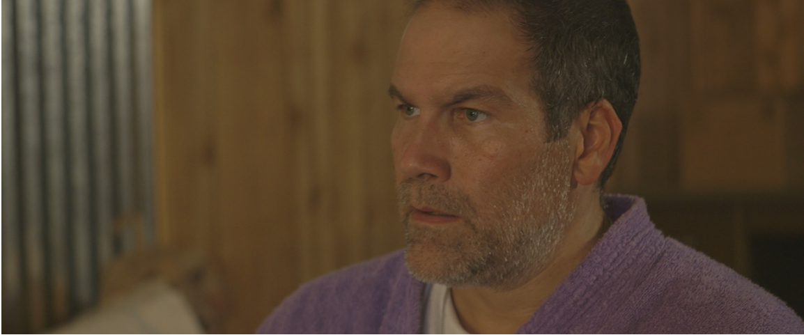
Fig. 5. Malachi before color correction

something a little more close to the real world. I think that having some imagery like this in the film lends it the sense of just-beyond-real that I wanted for the film (Fig. 7).