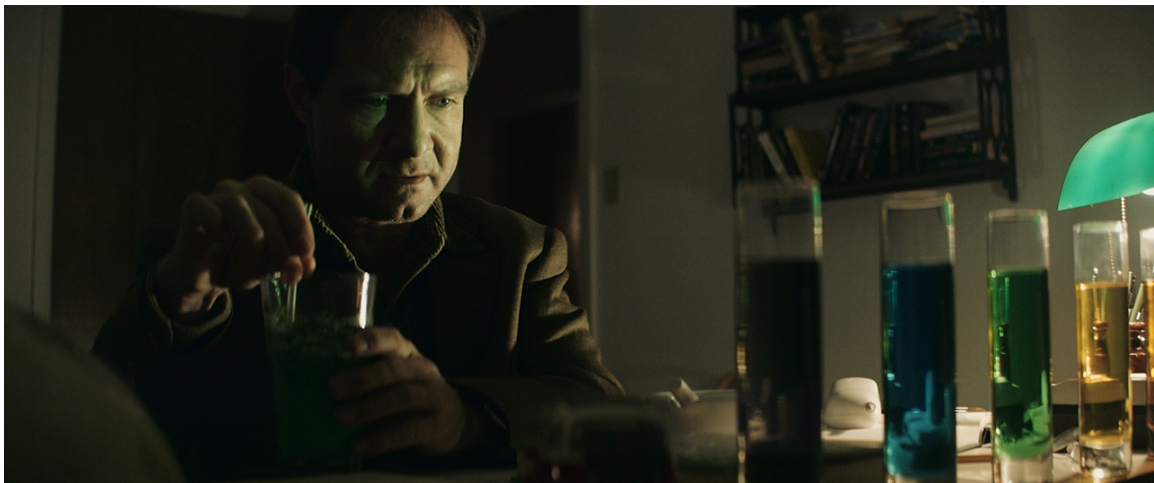
Fig. 1. Leon's study with green accent light

The first is the lighting of Leon's study. While Youngblood and I agreed on how we wanted it to look, during filming I devised the idea of having green light on Leon's face, as though from the green lamp on his desk, in order to convey the sickly, warped nature of the character. Aaron and I worked with the crew to find a way to create this look; the lamp was not sufficient, so we used an Arri light with a funnel of blackwrap and green gels on it, aimed to produce a slice of green light across Leon's face (Fig. 1).