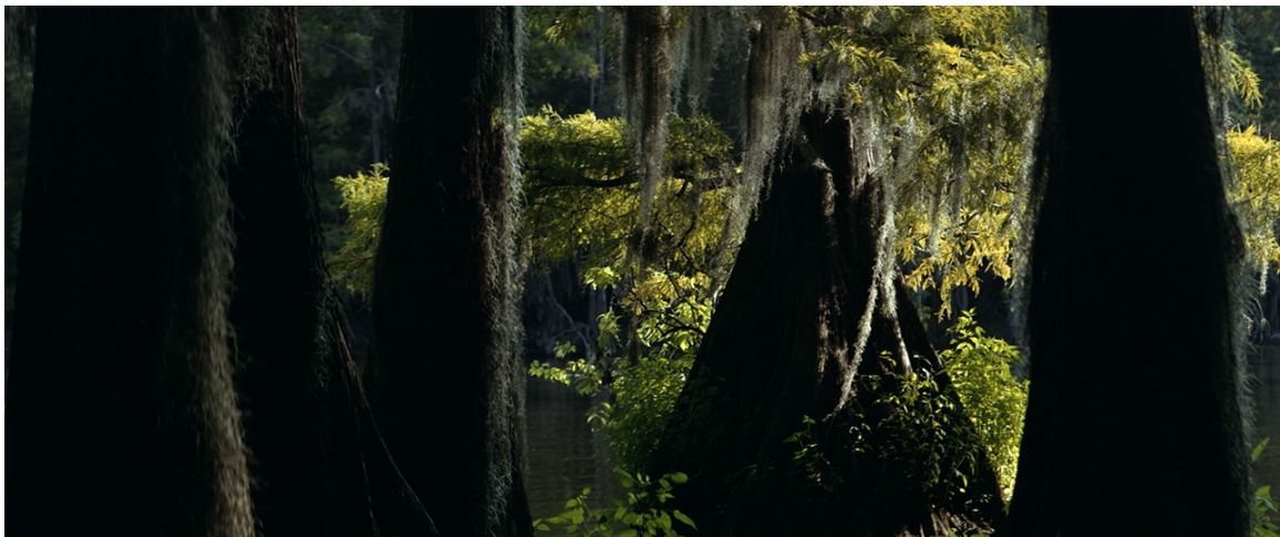
Fig. 4. Morning on Caddo Lake

Finally, not all lighting choices were about artificial lighting. Youngblood and I originally went to Caddo Lake before principal photography with the intention of shooting all the nature footage for the dream sequence. However, we were not happy with the generally dreary look of the cloudy daytime footage. As a result, we drove to Caddo Lake the night before principal photography there and shot new footage shortly after dawn, giving us the dramatic, high-contrast look that we wanted for these scenes (Fig. 4).