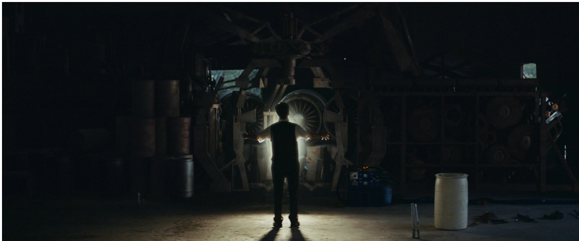
Fig. 9. The Paykel Device