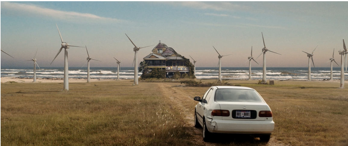
Fig. 7. Michael's house

I was not able to use miniatures for Leon's machine as I had planned, for a number of reasons. I came to realize after further research that I am not skilled enough in this kind of work to have confidence that I would pull it off well. However, I am very experienced in 3D modeling and texturing of computer generated images. Furthermore, I came to realize in looking at the footage we shot that the infinite flexibility of CGI to match lighting, camera angles, lenses, and other factors would be conducive to better compositing the images.