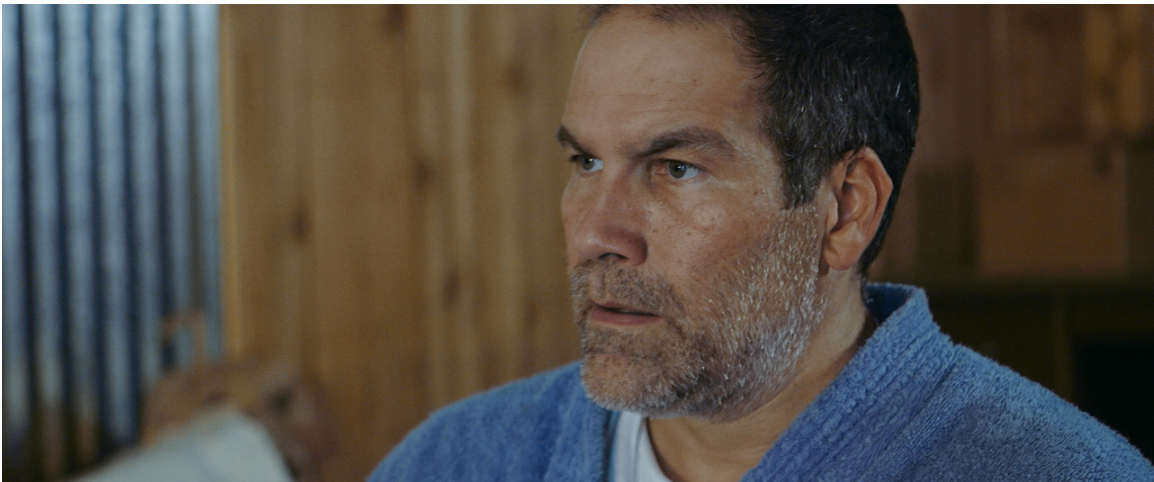
Fig. 6. Malachi after color correction